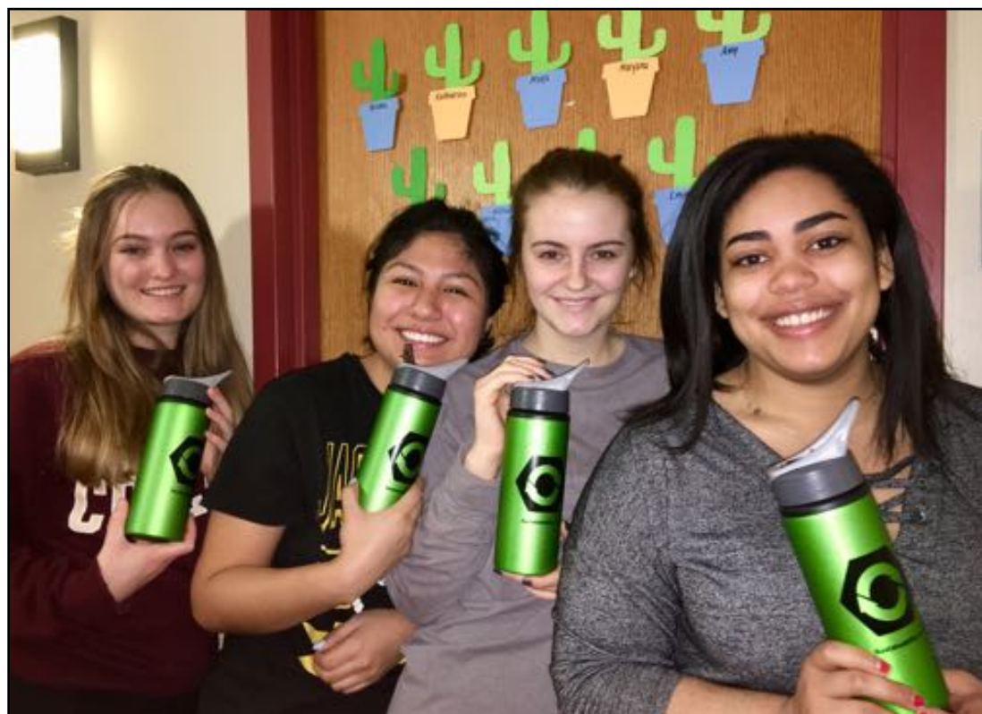
This is the last year members of the Sustainability LLC will live in Vanderslice Hall.

Alongside the program's academic focus, the program also incorporates activities involving sustainability that take place throughout the year.